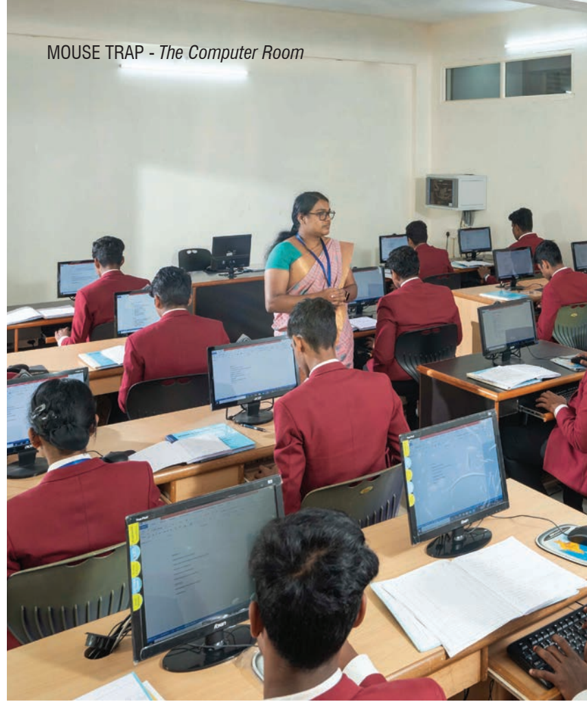
MOUSE TRAP - The Computer Room

B.Sc. (Hons) Hotel Management & Culinary Arts