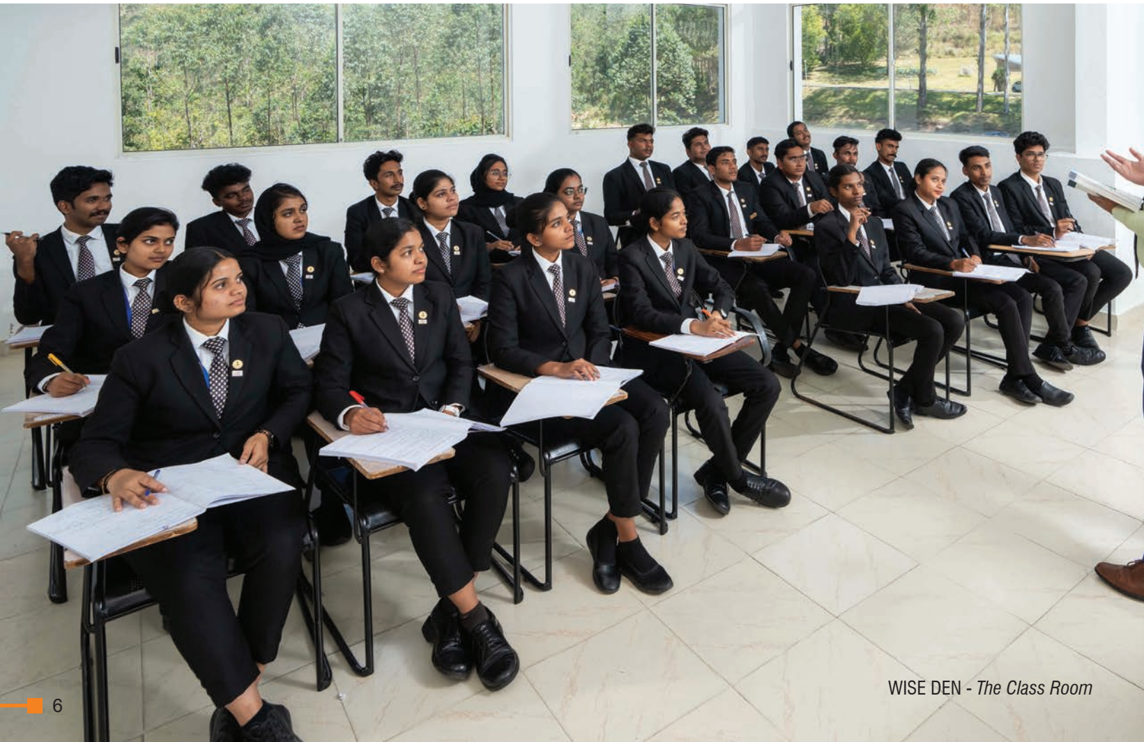
WISE DEN - The Class Room