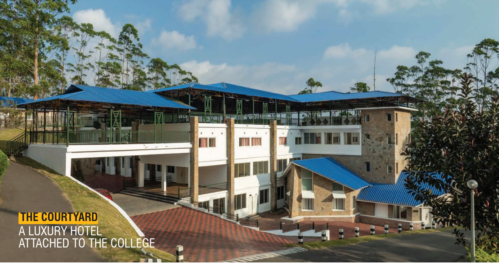
THE COURTYARD A LUXURY HOTEL ATTACHED TO THE COLLEGE