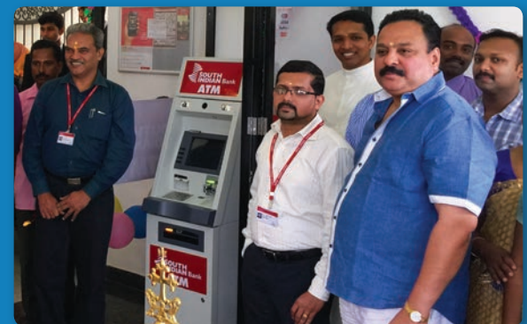
ATM Machine installed at the lobby of the campus