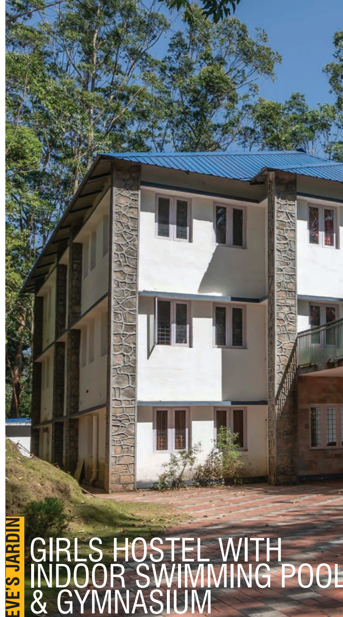
EVE'S JARDIN GIRLS HOSTEL WITH INDOOR SWIMMING POOL & GYMNASIUM

Hostel Fees : ₹1,02,000/- per academic year for food and accommodation, payable in advance. This is for the current academic year only and is subject to revision every year. The hostel fee is fixed considering the total expenses incurred during the entire course for study and divided per academic year. This amount is to be paid promptly along with the course fees irrespective of the period of stay in the hostel or period of training outside the campus during any semester.